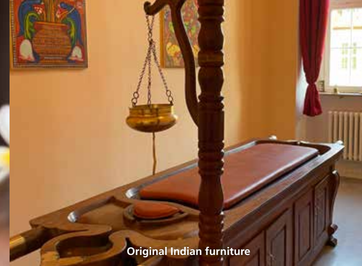
Original Indian furniture