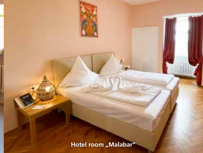
Hotel room „Malabar“