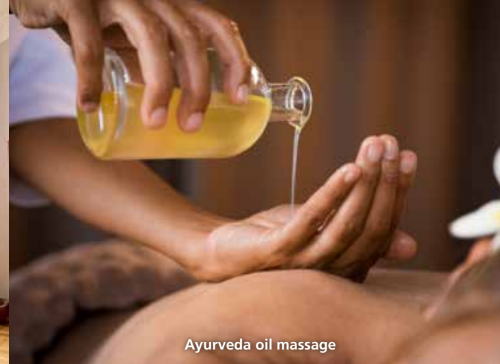
Ayurveda oil massage